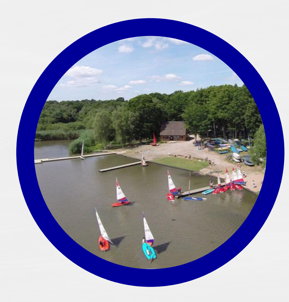
The friendliest? We'd like to think so