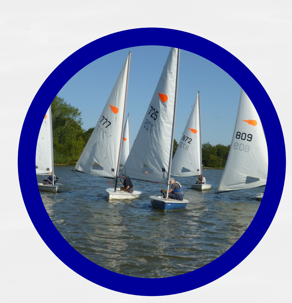
Where we sail Hedgecourt Lake, RH19 2QG